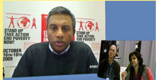
Salil Shetty interviewed live from COP15, via Skype

'Cheers to you guys. You worked extremely hard, did everything you set out to do, and really supported our strategy of connecting the bloggers to the inside game. Bravo!'