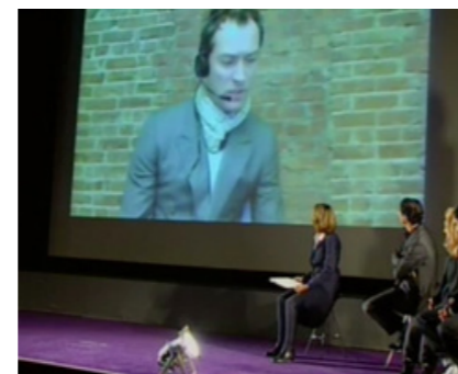
Jude Law takes audience questions

And much more unusually still, the actors and the panellists also took questions from people around the world, who had viewed the film in cinemas – and the entire event could be seen by everyone: at the National Film Theatre, in the other cinemas, and across the internet.